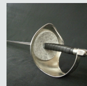
Economy Practice Saber 35" $38.50