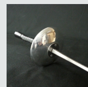
Economy Electric Foil 35" $40.50